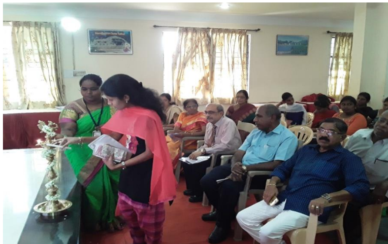
An Alumna Lit the Kuthuvilaku in the Presence of Chief Guests